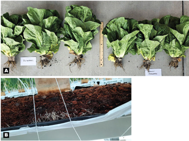
Pictured: Enhanced root development and health following application of A) RootShield PLUS (BioWorks, left) on Romaine lettuce (control: grower standard, right); and B) in greenhouse pepper following application of RootShield PLUS (Trichoderma harzianum T-22 and T. virens G-41). Note healthy white roots growing through the coco medium.

Recognizing we can't control the weather, what can we do to protect plants? Good agronomic and sanitation practices are fundamental, including environmental management when crops are grown