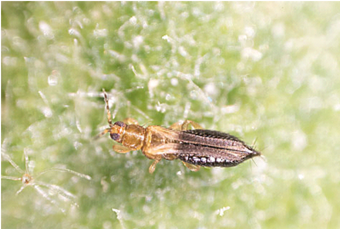
Figure 1. Adult female Thrips parvispinus.

also produces ornamentals. In this case, the transplants were destined for the retail home market, not a producer. Considering the diversified crops of many growers and greenhouse producers, pepper thrips can easily spread to both ornamental and edible species once it's present in a facility.