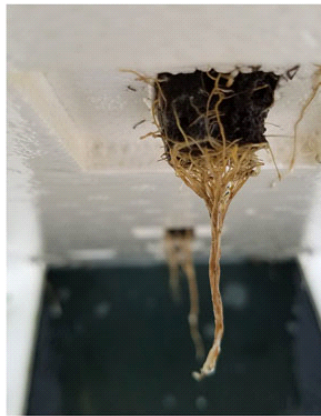
Figure 2: Darkly discolored lettuce roots due to black root rot infection caused by the fungus

Berkeleyomyces basicola (formerly Thielaviopsis