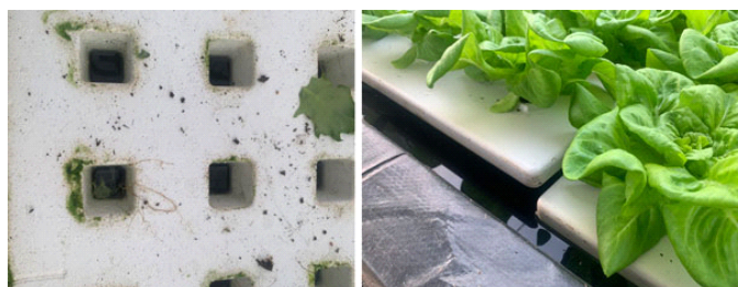
Figure 3. Polystyrene boards are porous. Plant roots harboring pathogens can channel into pores, and be very difficult to clean and disinfect. Contaminated rafts are often a source for root disease pathogens.

The water and nutrient solution conditions also affect Pythium populations and survival. High oxygen levels can reduce Pythium zoospore survival. Ensuring adequate aeration within the nutrient solution to achieve saturated dissolved oxygen (8 ppm O 2 ) in the nutrient solution can reduce Pythium survival. Maintaining cooler water temperature (68 to 72F/20 to 22C) is optimal for spinach and lettuce production, and can also slow Pythium survival and infection as well. Low oxygen and warmer root zone temperatures will increase Pythium problems.