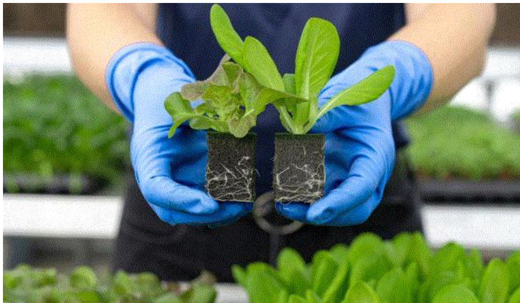
A comparison of square and round Oasis plugs.